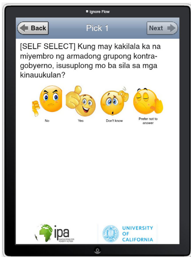
Figure 1 Self-Enumeration Screenshot.

Another 1/3 of subjects answered the questions using forced choice. Enumerators received extensive training implementing this technique and answered subjects' questions until they understood what to do. The enumerator instructed: